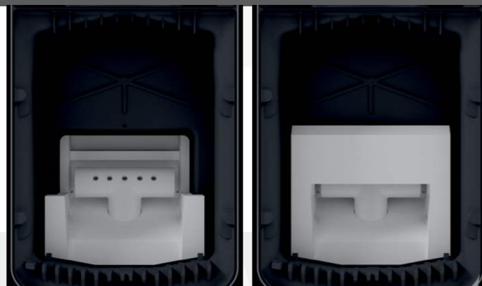
Refractory shaped bricks are made of fireproof concrete mix with resistance to high temperature (up to 1500 °C) and increased resistance to alkaline corrosion.